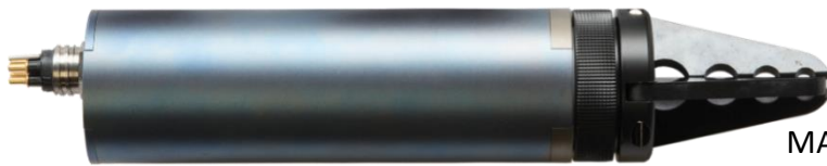
MANIPULATOR SHOWN WITH OPTIONAL TRIDENT GRIPPER, MPH-101